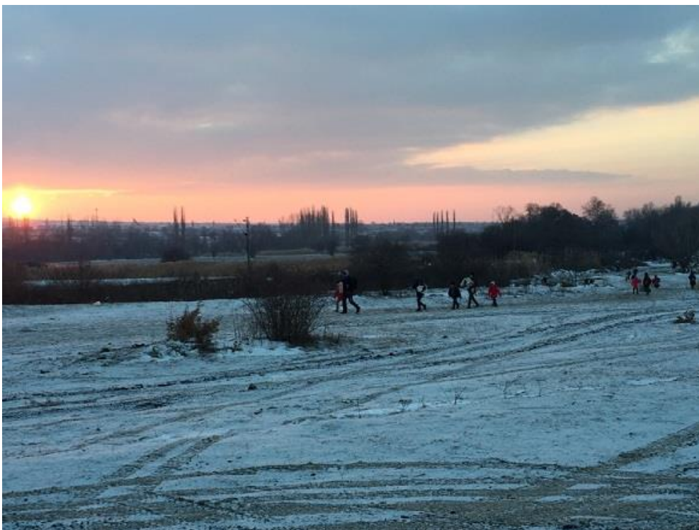
Asylum-seekers walking towards Miratovac RAP upon crossing the Serbian-former Yugoslav Republic of Macedonia border, Miratovac (Serbia), ©UNHCR, January 2016.

As of 4 February 2016, 279 individuals were relocated out of Italy and 202 out of Greece, totaling 481 persons relocated so far to 11 Member States. In terms of places pledged, 17 Member States and Lichtenstein have offered relocation places.