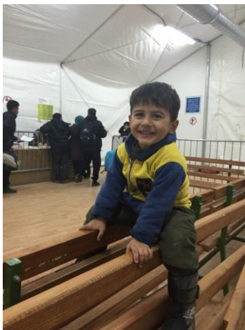
Refugee boy playing while waiting for registration Preševo (Serbia), ©UNHCR, 3 February 2016

2,760 refugees and migrants were assisted at the Miratovac Refugee Aid Point (RAP) upon arrival from fYRo Macedonia.