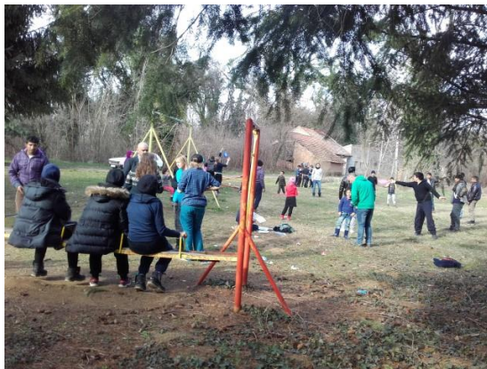
Refugees/migrants playing outside on a sunny day, Šid (Serbia), ©UNHCR, 22 February 2016

447 refugees/migrants stayed overnight in the Sid RAP, including 61 brought from Subotica RAP, 15 pushed back and 15 denied boarding by the Croatian authorities.