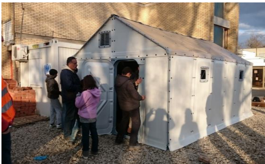
A new female dressing room set up in front of the RAP, Adaševci (Serbia), ©UNHCR, 24 February 2016

At Sid train station, UNHCR/HCIIT distributed 339 UNHCR blankets, 1,500 WFP HEB, 2,100 water bottles, 161 winter jackets, 94 boots, and 35 UNHCR bags. IDC/Sid Health Centre and WAHA treated 64. Approximately 600 refugees were hosted in the RAP.