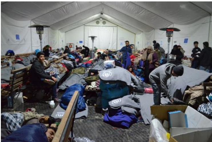
Refugees waiting in the rubhall following UNHCR distribution of blankets and sleeping bags Tabanovce transit centre (former Yugoslav Republic of Macedonia), February 2016.

As of 24 February 2016, 303 individuals were relocated out of Italy to nine Member States and 295 out of Greece, totaling 598 persons relocated so far to 15 Member States. In terms of places pledged, 19 Member States and Lichtenstein have offered relocation places.