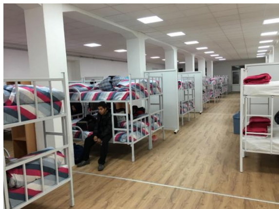
Tobacco factory phase I in use, Preševo (Serbia), 29 February 2016

Police, Gendarmerie, IOM, Philanthropy, Remar, Medical Center, UNHCR, MSF, DRC, World Vision and Indigo were assisting them at the RAP.