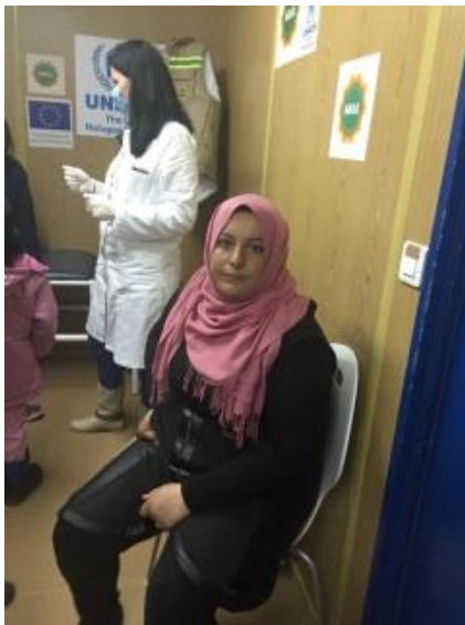
WAHA doctors provided a Syrian refugee with necessary medical care, Sid (Serbia), ©UNHCR, 7 March 2016

No train arrived from Croatia to Sid train station, consequently there were no departures of refugees.