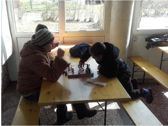
Refugees playing chess in the INTERSOS room with Wi-Fi and charging facilities, Adaševci (Serbia), 16 March 2016

521 refugees from Syria, Afghanistan and Iraq, slept at the Refugee Aid Point (RAP) in Sid. Rub-halls were overcrowded with families and children. UNHCR/HCIT distributed 1,020 water bottles, 200 WFP HEB, 41 UNHCR blankets, one winter jacket, three raincoats, 68 hygiene packages and 200 lunch packages. WAHA treated 59 refugees.