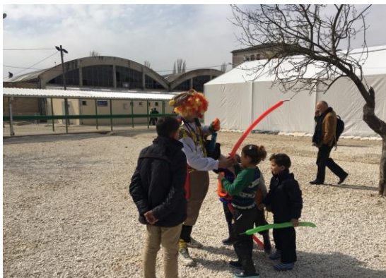
Recreational activities for children in the Reception Centre, Preševo (Serbia), ©UNHCR, 27 March 2016

On 25 March, 61 Syrian refugees, including women and children, tried to irregularly enter Serbia but were returned by police to the FYR Macedonia side of the green border, where NGOs and UNHCR provided them with humanitarian assistance. Later on the same day, FYR Macedonia authorities offered re-admission to Tabanovce and transport to Gevgelija.