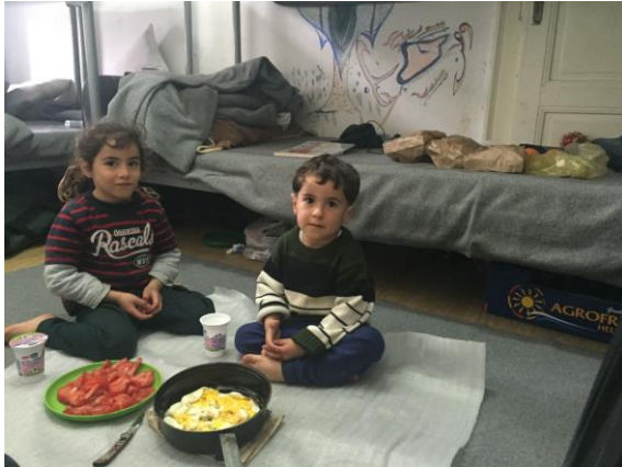
Children having breakfast in Sid RAP, Sid (Serbia)

The UN Country Team, Ministry of Foreign Affairs and Ministry of Labour and Social Welfare convened a 7th monthly Partners' Briefing on the refugee/migration situation in Serbia. The UNHCR Representative presented summary results of recent protection assessments, which UNHCR conducted together with authorities with all refugees currently in the country, highlighting new opportunities and challenges, including reception conditions, access to legal status and solutions.