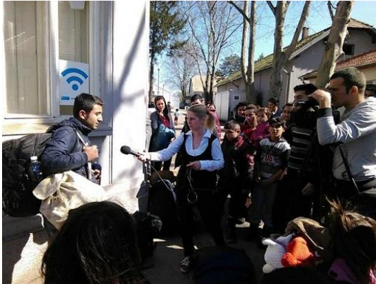
Local TV crew interviewing refugees in Šid RAP, Šid (Serbia), ©HCIT, 31 March 2016

The number of refugees sheltered in the three Refugee Aid Points (RAP) in the West dropped to 455 .