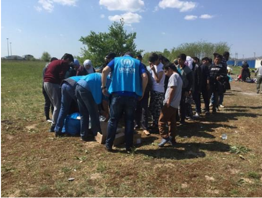
Distribution of aid at the Horgoš border crossing, Horgoš (Serbia), 12 April 2016

With some 40 refugees departing towards the Hungarian border, occupancy of transit facilities in the West dropped to 112 total: 39 refugees in Sid, 55 in Adasevci and only 18 in Principovac Refugee Aid Points (RAP). CRS/Divac Foundation continued to provide hot lunches in all three locations. The BCM/Sid Health Centre at Adasevci assisted six patients while WAHA treated another ten refugees in Sid and Principovac.