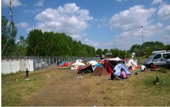
Improvised tents sheltering asylum-seekers near Horgoš / border crossing, Horgoš (Serbia), ©UNHCR, 20 April 2016

More than 360 asylum seekers, including 60 women and 47 children, waited outside the two “transit zones” near Kelebija and Horgoš I border-crossings. They came from transit sites in the West and Presevo, but many were also recent irregular arrivals in the country. They stayed in improvised tents without any garbage collection/disposal. Sanitary concern remain high in both sites. Lack of toilets also increases the risk for gender based violence. Some 30 asylum seekers were admitted into each “transit zone”.