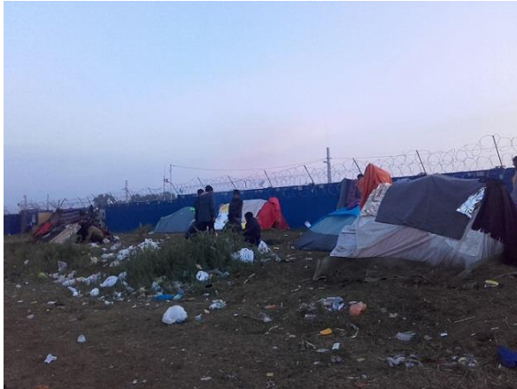
Asylum seekers at the Kelebija border crossing waiting to be admitted to the Hungarian "transit zone", Kelebija (Serbia), ©UNHCR, 25 April 2016

They stayed in improvised tents without any sanitary facilities nearby. In order to improve hygienic conditions MSF helped with the garbage collection at both sites.