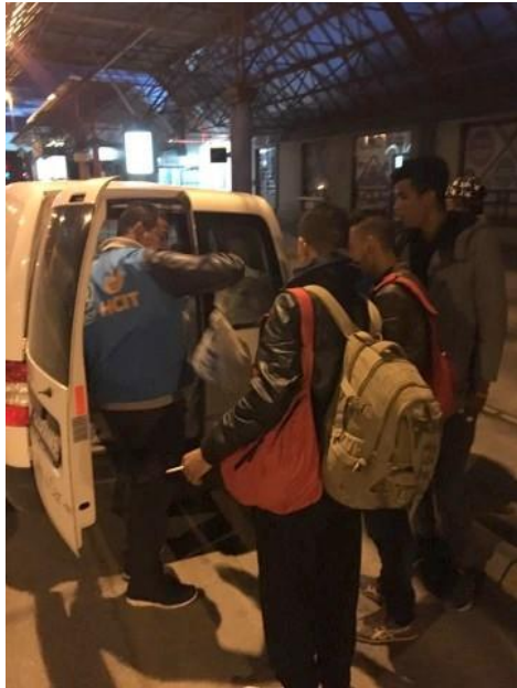
Distribution of food and non-food aid at the bus station in Subotica, Subotica (Serbia), ©HCIT, 13 May 2016

On a daily basis an average of 290 asylum seekers, including many women and children, waited to be admitted into the two “transit zones” at Kelebija and Horgos I border crossings. 126 accessed Hungarian asylum procedures while Hungarian authorities returned 22 single men (15 Afghans, five Iraqis and two Moroccans) to Serbia after spending 23 days in admission containers.