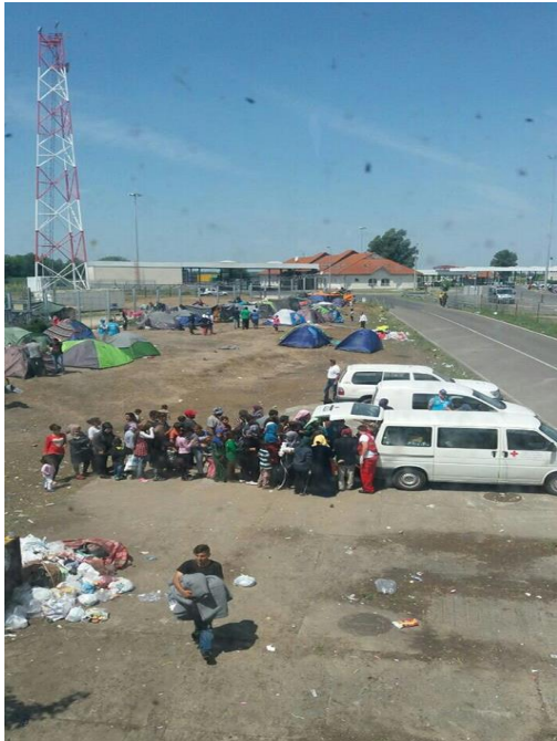
Distribution of humanitarian aid, Kelebija (Serbia), @HCIT, 27 May 2016

Between 395 to 572 asylum seekers, mainly women and children, camped outside the “transit zones” at Kelebija and Horgos I border crossings for days in the open still without shelter or access to sanitary facilities.