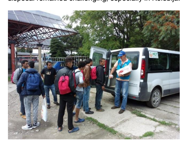
Distribution of aid outside the main bus station in Subotica, Subotica (Serbia), @HCIT, 14 June 2016

About 600 asylum seekers, stayed for days and some for weeks in improvised tents outside the "transit zones" at Kelebija and Horgos I border crossings. Sanitary conditions at the border crossings were mitigated by authorities installing more chemical toilets in each site, while garbage collection and disposal remained challenging, especially in Kelebija.