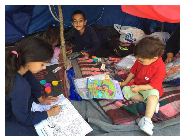
World Refugee Day outside Horgos I "transit zone", Horgos (Serbia), 20 June 2016

Over 670 asylum seekers were present in the North on a daily basis. Around 340 stayed for days or weeks in improvised tents outside the "transit zones" at Kelebija and Horgos I border crossings. Even if there are still gaps to address, the sanitary conditions in both sites improved after a regular cleaning of toilets and garbage collection.