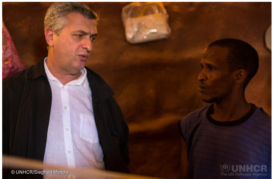
UNHCR chief Filippo Grandi talking to a refugee during his visit to Dadaab camps.

Both the High Commissioner and refugee Representatives thanked the Government of Kenya for its generosity of hosting refugees for many years and its efforts to promote asylum.