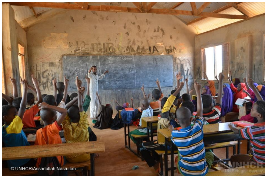
Students in their classroom at Hurmod Primary School, Ifo camp of Dadaab, Kenya.