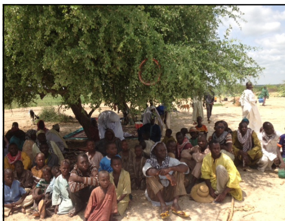
Left: Newly-arrived Nigerian refugees in the Lake Chad area, August 2014.

** Hosting villages: Koldaga, Bekourou, Dillingala, Doubadene & Dembo