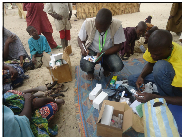
Right: UNHCR Partner in health, Centre de Support en Santé Internationale (CSSI), attending to Nigerian refugees.