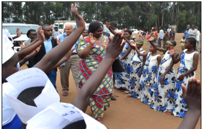
Ceremony in Kigeme camp, home to over 18,000 refugees, celebrating the rice distribution with MIDIMAR, UNHCR, WFP and partners including ADRA.