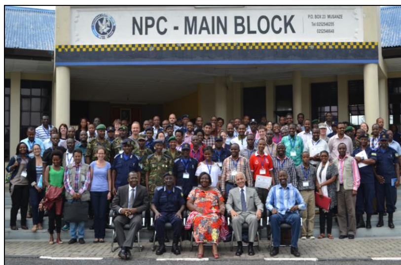
Front row (left to right): UNHCR Deputy Representative; Coordinator for RNP; Hon. Minister of MIDIMAR; UNHCR Representative; MIDIMAR Permanent Secretary

The exercise was the first such emergency simulation exercise organized in Rwanda for refugee influx. (Highlights continued on p. 3.)