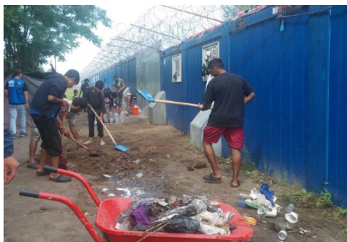
Refugees cleaning the border area, Horgoš (Serbia), 5 August 2016

The SCRM, UNHCR, HCIT, UNICEF, IOM, MSF, MDM, HELP, CRS/BCM, Group 484 and the Red Cross provided humanitarian aid, including bottled water, food, fresh fruits, hygiene packages and other non-food items, medical assistance as well as legal and other counselling.