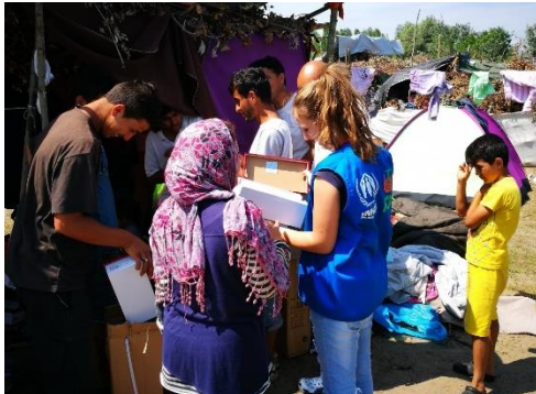
Distribution of shoes at Horgos, Horgoš (Serbia), 9 August 2016

Over 1,100 asylum seekers were present at the end of the reporting period at the border with Hungary. The numbers of those waiting in the open for long periods of time in difficult conditions on Serbian soil near the Hungarian “transit zones” continued to decrease to around 380 in Horgos I and around 180 in Kelebija, predominantly women and children from Afghanistan and Syria. The SCRM sheltered an additional up to 540 asylum-seekers in the Refugee Aid Point (RAP) of Subotica.