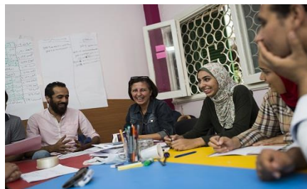
Workshop on livelihood activities