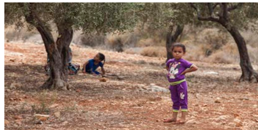
Rass Maska informal settlement in Lebanon. Approximately 75 per cent of the settlement population find casual job opportunities as daily workers, earning about USD 10 – 15 per day.

In Egypt, 67 people received training for livelihoods purposes in August. The Livelihoods sector also conducted a training on monitoring and evaluation to test new developed livelihood indicators in the field.