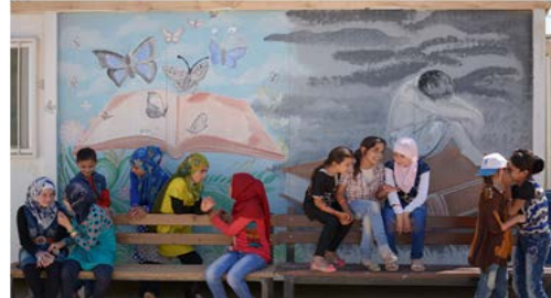
Zaatari Syrian refugee girls gather for a meeting of TIGER (These Inspiring Girls Enjoy Reading) programme which targets refugee girls who have dropped out of school, or who are at risk of dropping out of school.

Strengthening education systems is a core component of the refugee education response as it allows education systems to better respond to the increased needs of Syrian and host communities children.