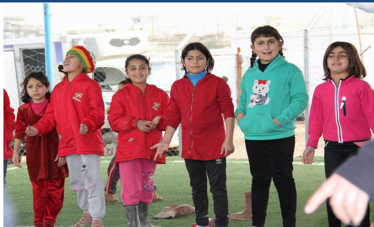
Basirma Camp, Erbil, Girls in Child Friendly Space.