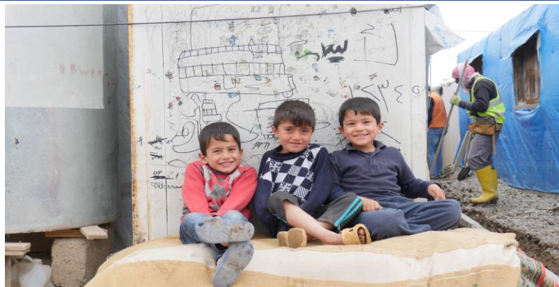
Domiz 1 Refugee Camp, Duhok Governorate