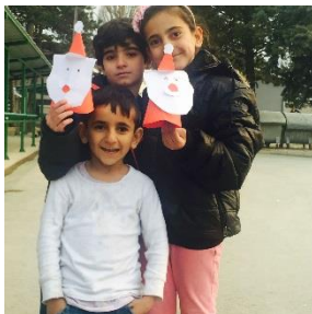
Refugee children playing at the RC, Presevo (Serbia) 04 December 2016

Over 1,100 refugees, asylum-seekers and migrants were accommodated in two RCs: Presevo (908) and Bujanovac (206). Some 43% of residents of Presevo RC are from Afghanistan, 23% from Iraq, 19% from Pakistan, and 8% from Syria. Residents of Bujanovac RC, which accommodates only families and unaccompanied and separated children, are from Afghanistan (35%), Iraq (35%) and Syria (30%).