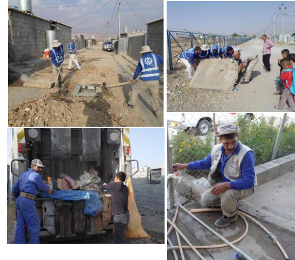
WASH service provision, operation and maintenance in on Arbat Camp, Sulaymaniyah, UNHCR and ThW. Clockwise from top left: Installation of manholes; replacement of manhole covers; repair of household water connections and garbage collection.