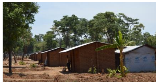
Transitional shelters' construction site in Nduta refugee camp.

Shelter: Some 4,249 transitional shelters were constructed during the reporting period, including all transitional shelters funded by the European Civil Protection and Humanitarian Aid Operations (ECHO) targeted to be completed by the end of the financial year 2016.