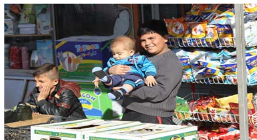
Young refugees are supporting their family business, Kawergosk camp.

Additional opportunities for resettlement and other forms of admission, including humanitarian visas, academic scholarships, and labour mobility schemes, are also needed.