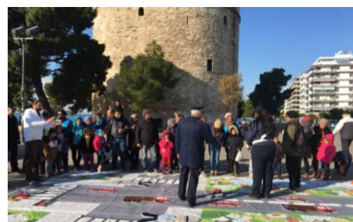
Asylum-seeker children from Oreokastro site attend a road safety training/game organized by UNHCR and the Traffic Police at the White Tower of Thessaloniki © UNHCR / December 2016