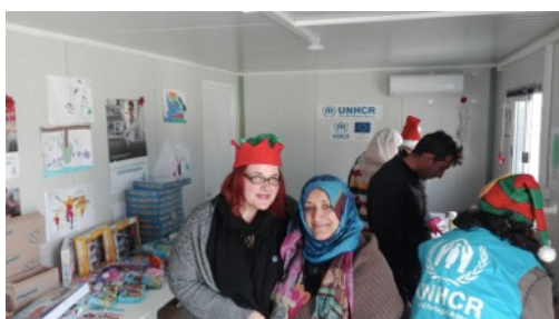
An asylum-seeker woman in Vasilika site smiles after choosing her gift at the free shop set up by UNHCR as part of the community-based interventions for the festive season © UNHCR / December 2016