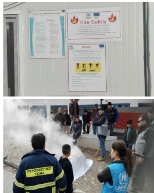
Awareness material displayed on prefab houses in Alexandria site and fire safety training conducted in Lagadikia site by the Greek Fire Brigades, in collaboration with UNHCR, for refugee men, women and children