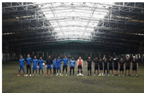
Young asylum-seekers from Alexandria and Kalochori/Iliadi sites play football at the final tournament game organized by UNHCR as part of the community-based interventions

In addition to the festive season-related activities, UNHCR also supported Terre des Hommes in organizing a football tournament for asylum-seekers , divided by teams according to the site of residence. Terre des Hommes provided transportation, lunch boxes, uniforms and athletic shoes, as well as medals and some prizes for winners (Greek-Arabic dictionary). UNHCR organized the medical examinations for the football players, in collaboration with the mobile team of Praxis, and escorted them to the pitch. The final match, disputed between Alexandria and Kalochori/Iliadi teams, ended with the winning of the Kalochori/Iliadi team. Through its partner Solidarity Now, UNHCR has also established the " Thessaloniki Community Centre " (in Ptolemon Street), which refugees, migrants and local people in need of services can approach. Over 100 people were received at the front desk in December and provided with basic services, including psychosocial support, legal aid/counselling, health care by the medical NGO MdM located in the same building, one communal activity per day at 17:00 h targeting different groups (children, mothers, teenagers, youth, etc.), and distribution of in-kind donations received by Solidarity Now (baby clothing, shoes, winter clothing, snacks).