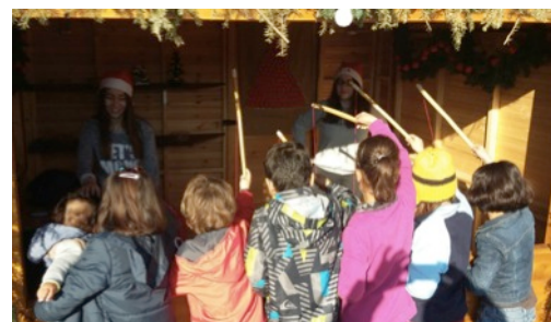
Asylum-seeker children from Pieria (Ktima Iraklis) site play at Katerini Christmas Market, at a trip organized by UNHCR as part of the community-based interventions for the festive season