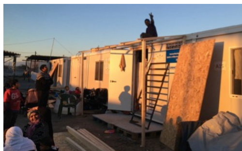
Shelter improvement realized by the asylum-seekers at Alexandria site, thanks to material and tools provided by UNHCR and coordinated by a very skilled community carpenter