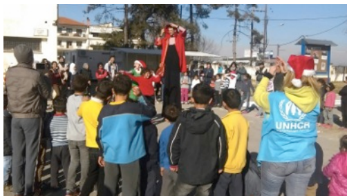
Young asylum-seekers at Alexandria site enjoy a Christmas show organized by UNHCR as part of the community-based interventions for the festive season

SMS training to 21 staff from UNHCR and partners on 14 December in Thessaloniki. It was the second part of a comprehensive training package, which will end with a “training of trainers” for the local and central authorities, in Greek language.