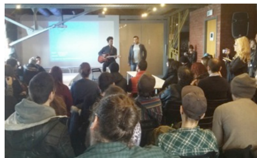
Renowned British musician Brian Farrow joined the photography/documentary workshop for refugee children titled "Life through the eyes of the others", organized at the Thessaloniki Film School, in collaboration with UNHCR © UNHCR / December 2016