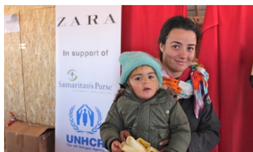
Happy asylum-seeker mother and daughter at Nea Kavala site wearing hats and scarves donated to UNHCR by ZARA © UNHCR / December 2016

"Our lives changed dramatically after receiving the heaters! Before, we used to burn plastic and anything else we could find to warm up at least a little bit" said Manaa Al Hussein, father of 43 years old from Syria, now living in a UNHCR prefab house in Nea Kavala site © UNHCR / December 2016