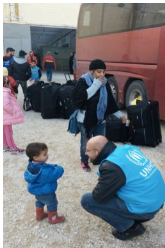
In collaboration with authorities and IOM, UNHCR staff assists asylum-seekers from Kavala site to move to alternative accommodation provided by IOM © UNHCR / December 2016