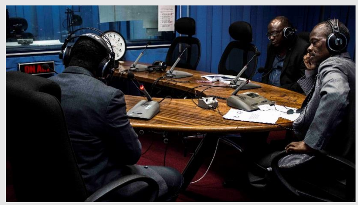
Monrovia, Liberia

Live radio discussions took place in Liberia between UNHCR, the Liberian Refugee Repatriation and Resettlement Commission, and the Ministry of Foreign Affairs on the Abidjan Declaration and on progress made by Liberia on eradicating and preventing statelessness.