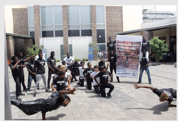
Accra Mall, Ghana

The events related to the celebrations of the 1<sup>st</sup> anniversary of the Abidjan Declaration enjoyed wide media coverage throughout the region – statelessness was the hot topic on national TV and radio stations, in print media, and on social networks: