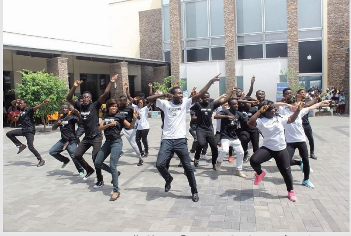
Accra Mall, Ghana