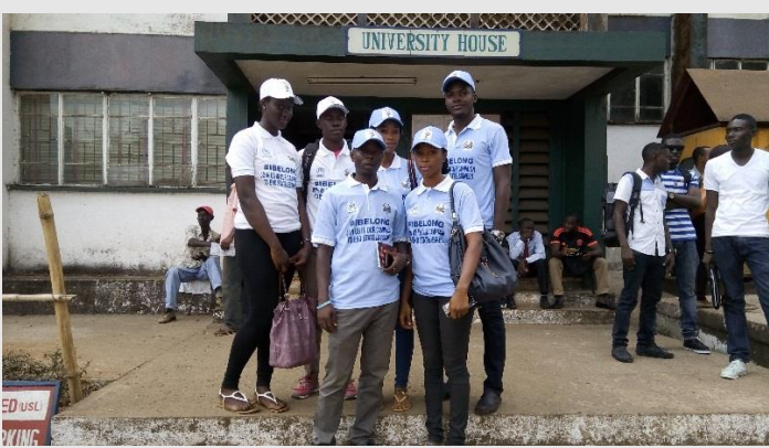
University students, Sierra Leone