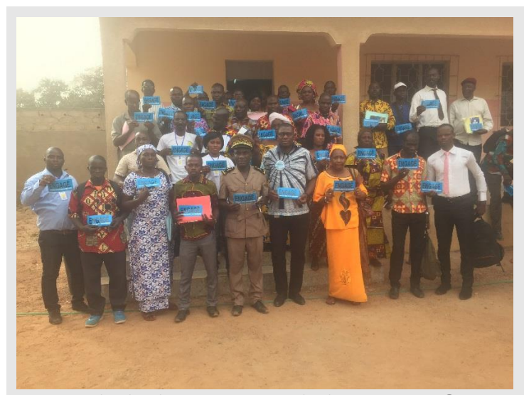
Training local authorities, community leaders, Ivory Coast