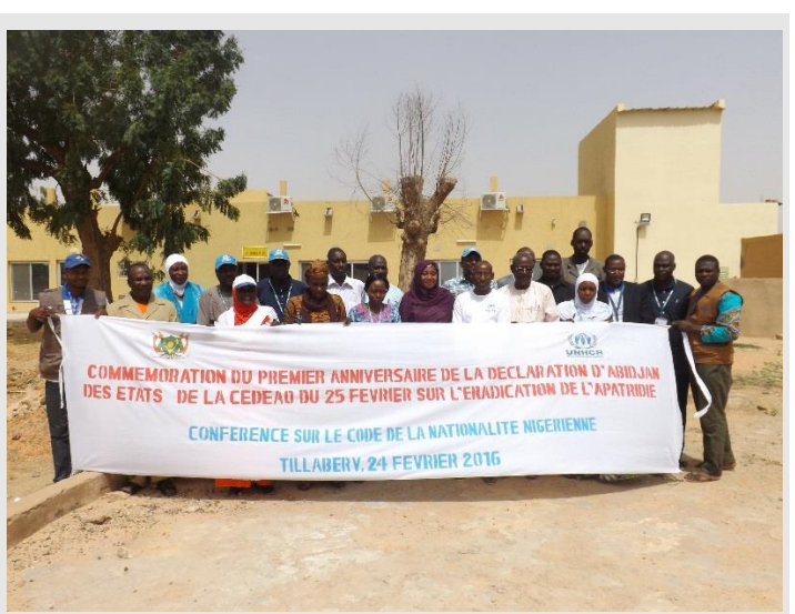
Conference participants, Niger