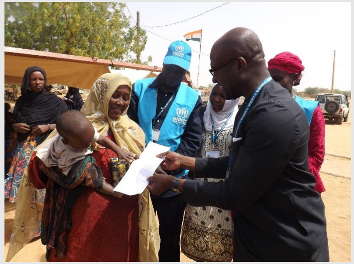
Delivery of birth certificates, Niger