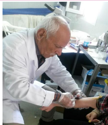
A laboratory technician is taking blood sample, DoH-Erbil, Darashakran