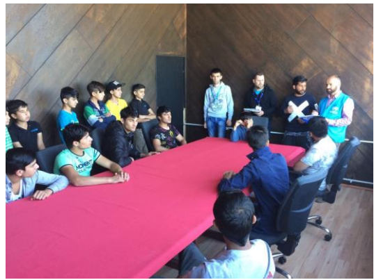
Focus group discussion with refugee boys in Presevo RC, Presevo (Serbia) UNHCR, 18 May 2017

499 refugees and migrant were accommodated in four Reception Centres: 209 in Pirot, 188 in Divljana, 61 in Dimitrovgrad and 41 in Bosilegrad. Most are from Iraq and Afghanistan, followed by Syria, while around half are children.