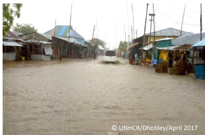
Somali returnee arriving from Kenya with the return flights [left] after roads in areas of return became inaccessible [right].