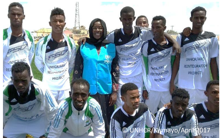
Opening of the Wamo football stadium in Kismayo.