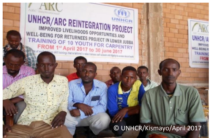
Participants at the training on tie and dye [left] and carpentry [right] in Kismayo.