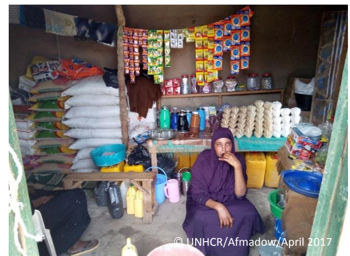
A Somali returnee opened a small business after receiving support from UNHCR in Afmadow.