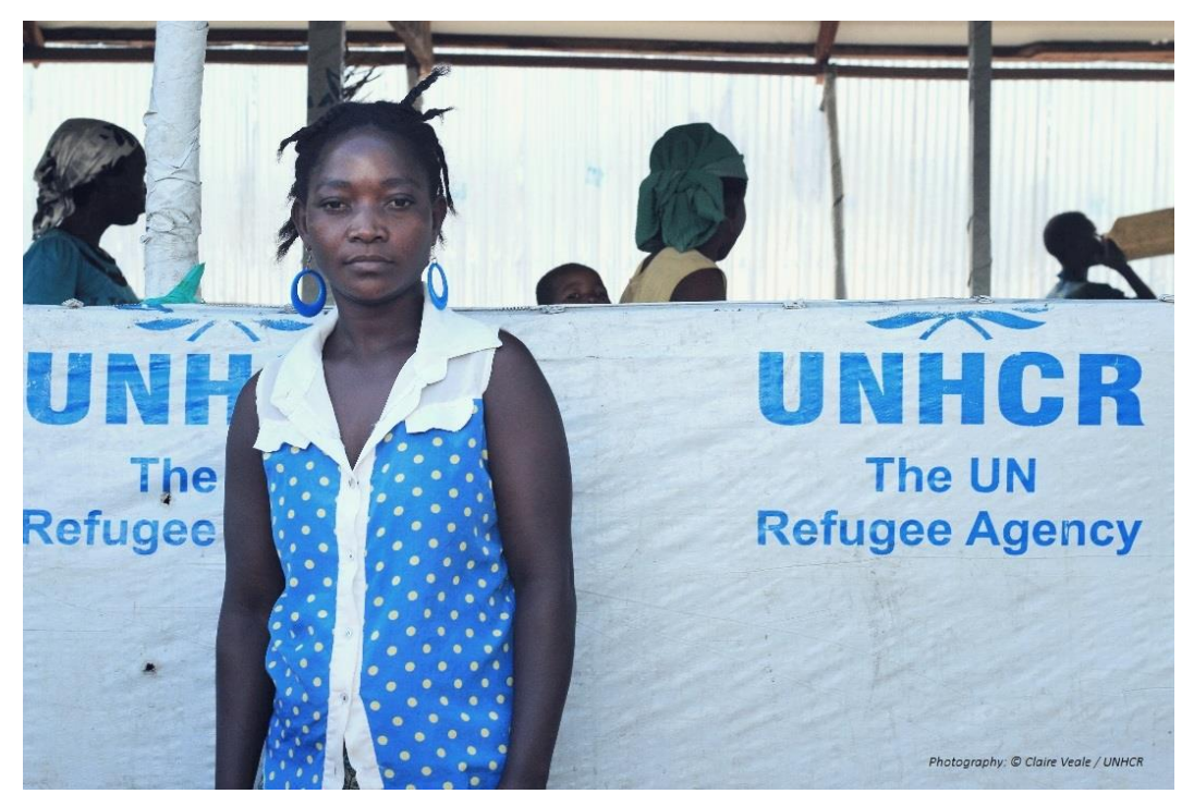
A young woman waits, along with over 1,000 other Burundian refugees, outside the UNHCR host structures for as place inside the transit centres, with little access to food, shelter and medical assistance.