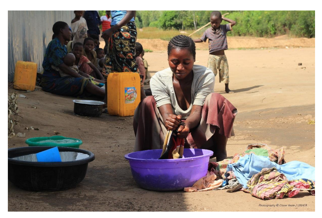
A woman washes her family's clothes outside the gathering point of Sange. She has been waiting for a place inside the centre for over 3 months.