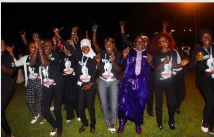
On the evening of the third day, celebrating the validation of the Banjul Plan of Action

The validation of the Banjul Plan of Action drew the attention of national, African and international medias. Further articles and media resources are available here . Two videos also offer a unique insight into the expert meeting and ministerial meeting .