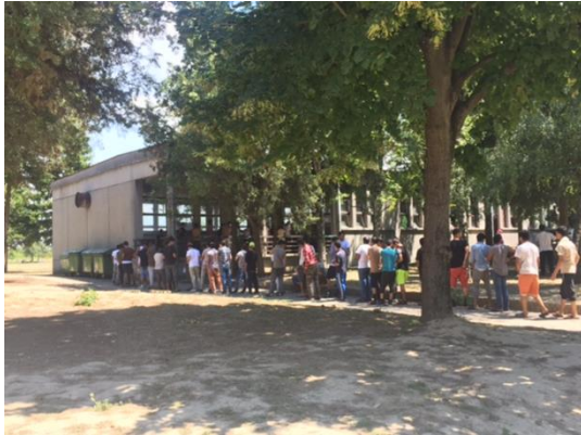
Lunch time in the center, TC Obrenovac (Serbia), ©UNHCR, 18 July 2017