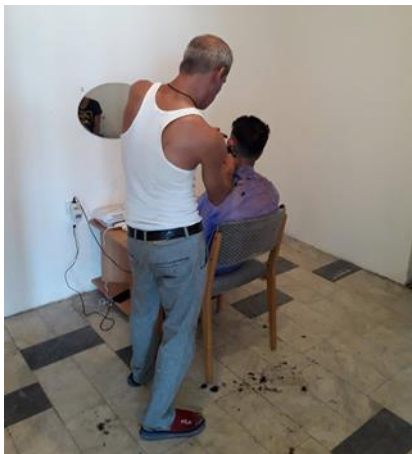
Refugees improvised a barber/hair salon in Kikinda TC, (Serbia), ©UNHCR, 1 August 2017

They are mainly from Afghanistan, followed by Iraq, Pakistan, and Syria. More than half are children, including app. 130 UASC.