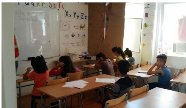
Serbian language classes in Adasevci TC, Adasevci (Serbia), ©UNHCR, 6 September 2017

334 refugees and migrants were accommodated in four Reception Centres: 149 in Pirot, 113 in Divljana, 40 in Dimitrovgrad and 32 in Bosilegrad. Most are from Iraq and Afghanistan, followed by Syria, while around half are children.