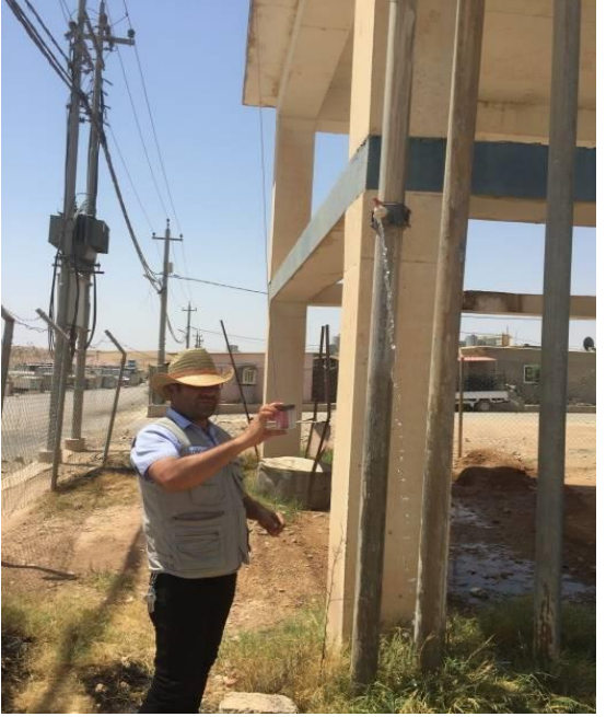
Water quality monitoring in Domiz refugee camp, Duhok.

Sulaymaniyah: Hygiene promotion: Door-to-door hygiene promotion sessions and focus group discussions (FGD) on diarrhoea prevention continued, targeting 2,119 families. UNHCR is coordinating with the directorate of electricity to provide 24/7 hrs of electricity to operate the borehole.