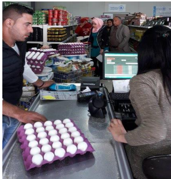
Syrians in a camp in Sulaymaniyah line up to buy eggs and other products through their WFP SCOPECARDS.

WFP has extended its agreement with World Vision International - Kurdistan Region of Iraq for a further six months, effective 01 July 2017. WVI-KRI is WFP's only partner for the provision of cash-based transfers to Syrian refugees in Iraq.