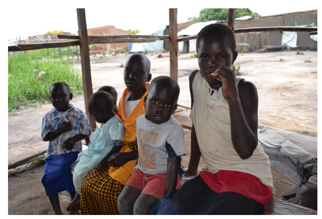
Newly arrived refugee children at the Biringi site waiting to receive a hot meal and to be allocated to their temporary home in one of the transit hangars. © UNHCR / A.Cadonau August 2017