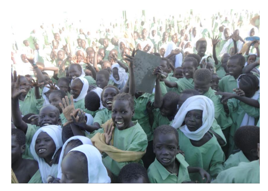
South Sudanese refugee students in White Nile. Photo Credit : H, Ahmed ; UNHCR, 2017.