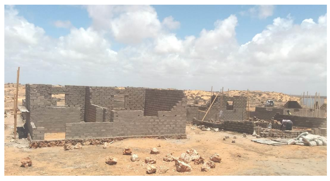
Ongoing construction of the final 100 shelters and 100 latrines in Kismayo.