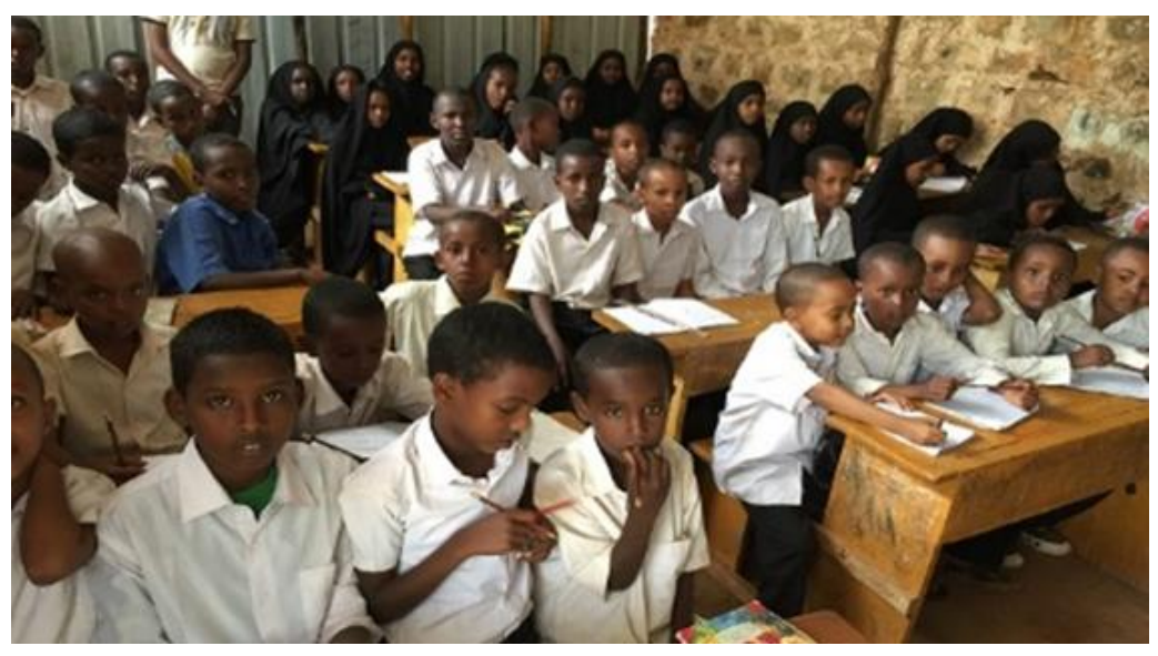
Newly enrolled children in Baidoa © UNHCR / September 2017