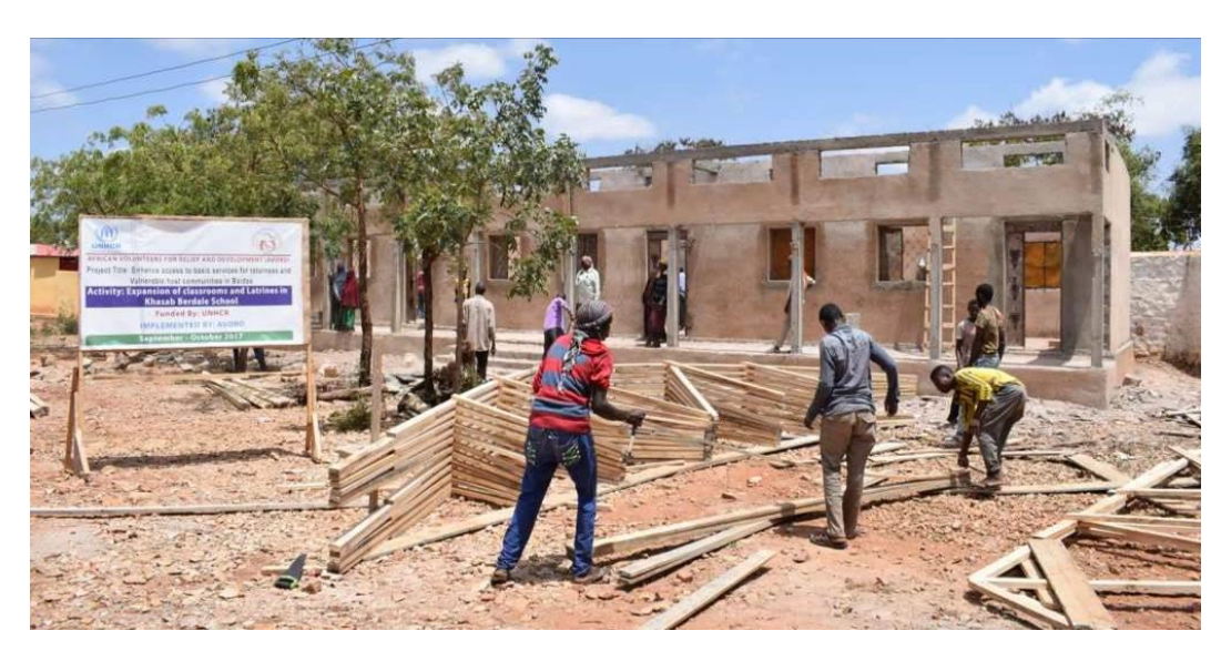
In September three classrooms and four latrines were constructed at a primary school in Baidoa. © UNHCR / Baidoa, September 2017