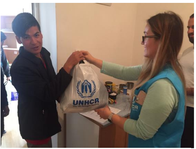
Distribution of winter clothes, Subotica (Serbia), 19 Oct 2017

Transit Centres (TCs) in the West sheltered 569 refugees and migrants: 367 in Adasevci and 202 in Principovac.