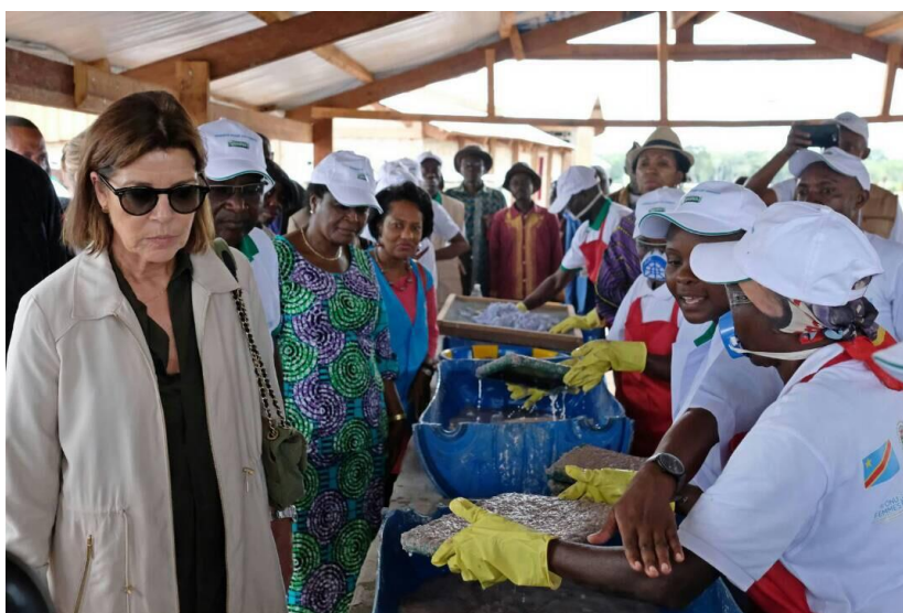
H.R.H. Princess of Hanover visiting Inke camp