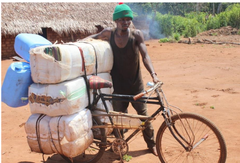
Transport of relief items to Ndu by bike because of lack of roads suitable for vehicles

New arrivals from CAR are mainly settled along the rivers Ubangi and Mbomou that constitute the border between CAR and DRC. Access to these areas is extremely difficult, because of lack of infrastructures (most of the bridges are destroyed or missing) and in some cases because of the security situation. Lord's Resistance Army (LRA) and other armed groups are operating in Bas Uele province.