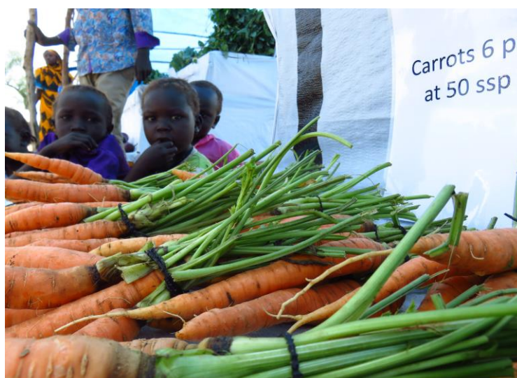
Farming yields display by Host community and refugee farmers during joint agriculture trade fairs held in Yusuf Batil refugee camp.